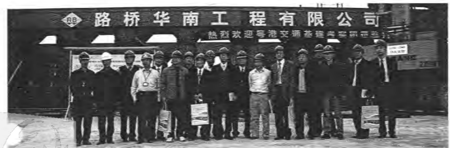
香港代表參觀廣州國道主幹線繞城公路東段之工程。 Representatives from Hong Kong visited the regional transportation network in Guangzhou.

A Forum and Site Visit on Transport Infrastructure in Guangdong Province was held by ETWB and the Guangdong Provincial Communication Department on 11 January 2006 in Guangzhou. About 30 representatives from Hong Kong participated and perused the regional transportation network and the links with other provinces as an initiative under the Pan-Pearl River Delta Cooperation.