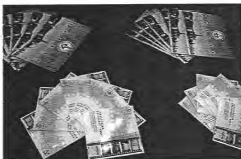
建造業安全獎勵計畫巡迴展覽 2005/06 Construction Industry Safety Awards Scheme 2005/2006 Roving Exhibition

The Labour Department had invited the Occupational Safety & Health Council (OSHC), the Construction Industry Training Authority (CITA), the HKCA, the Hong Kong General Building Contractors Association (HKGBCA), and the Hong Kong Construction Industry Employees General Union (HKCIEGU) to jointly organise a roving exhibition on 18 February 2006 in Olympian City, which promoted the safety issues of the construction industry.