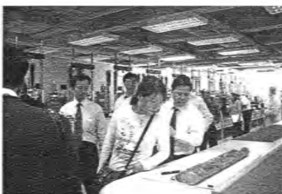
參觀金門實驗室 Visit the Lab of Gammon