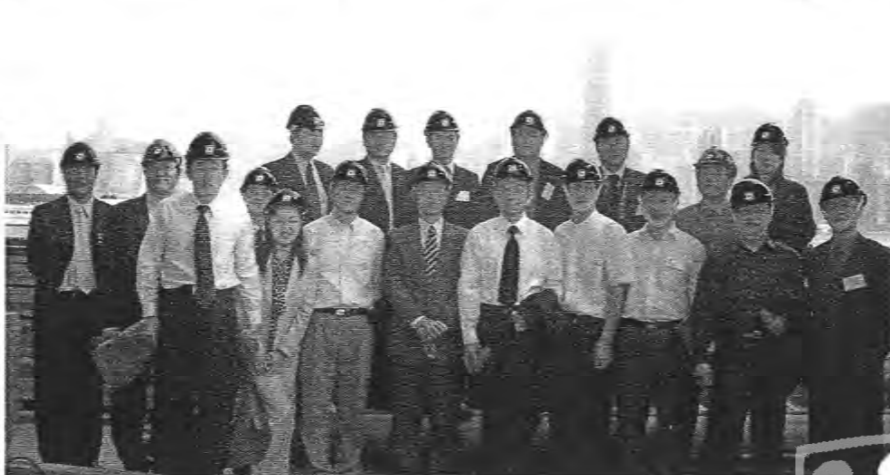
環球大廈 International Commerce Centre