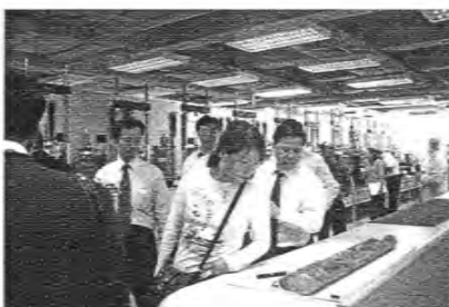
參觀金門實驗室 Visit the Lab of Gammon