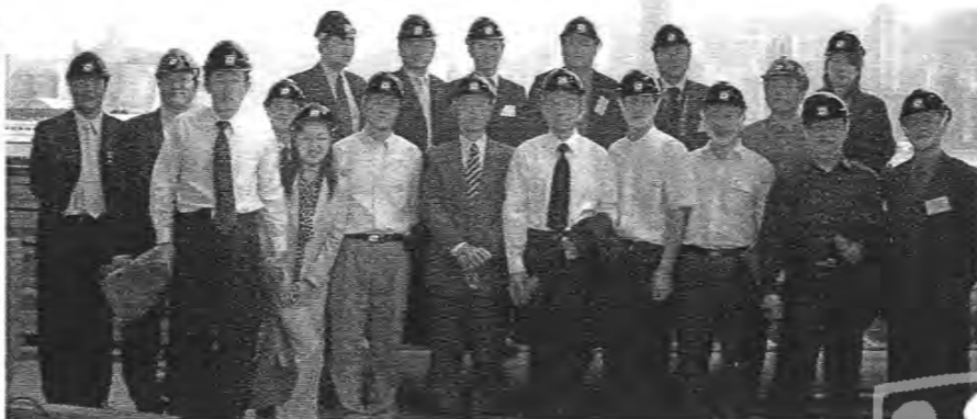
環球大廈 International Commerce Centre