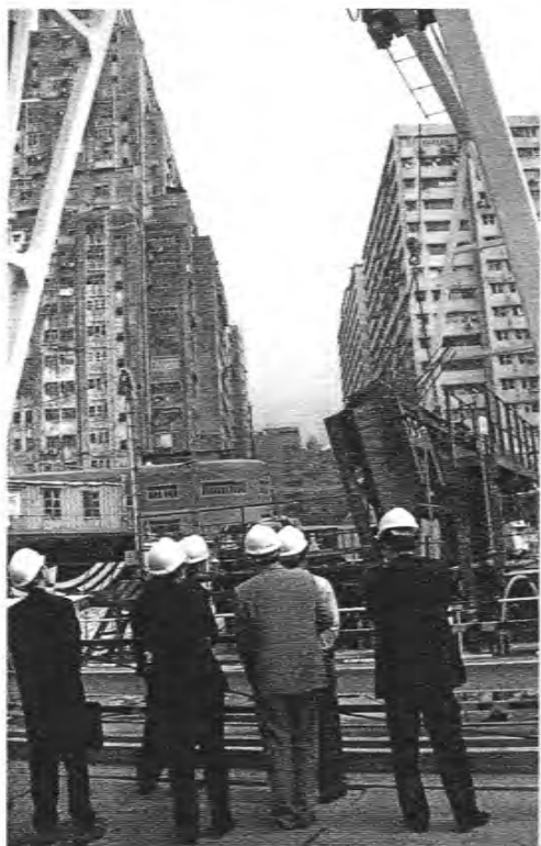
半預製建造系統 Semi-precaster Construction System